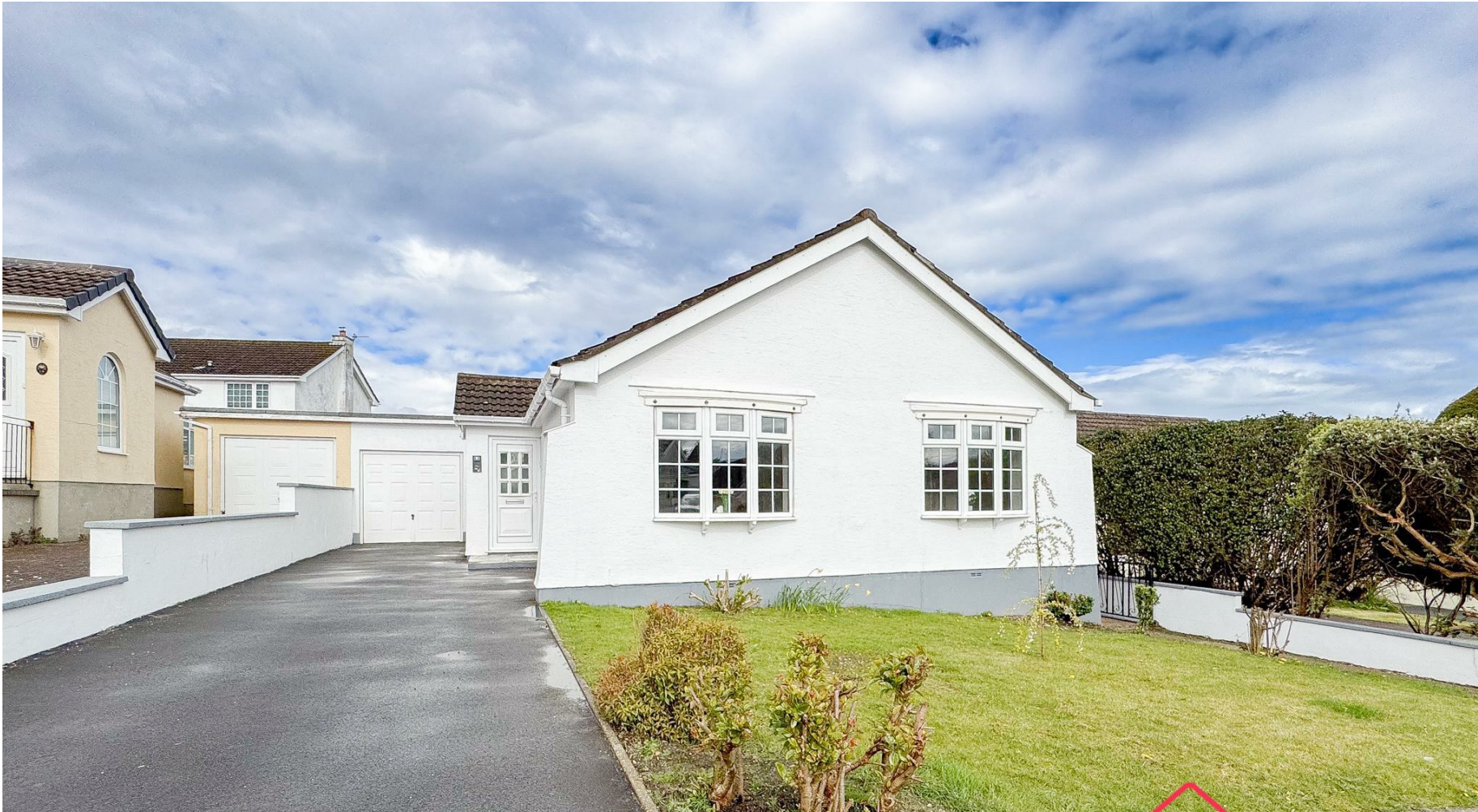
12 Harcroft Avenue, Douglas, Isle of Man, IM2 1PB Asking Price £449,950